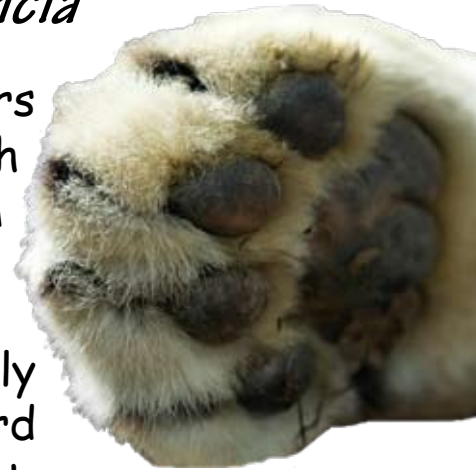
Snow leopard paw showing the thick hair underneath.

The large paws have hairs on their soles for warmth and grip to prevent them sinking into the snow.