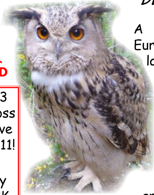
Proud dad Pip, himself bred here in 1989

A sub-species of the European Eagle Owl, the largest species of owl in the world.