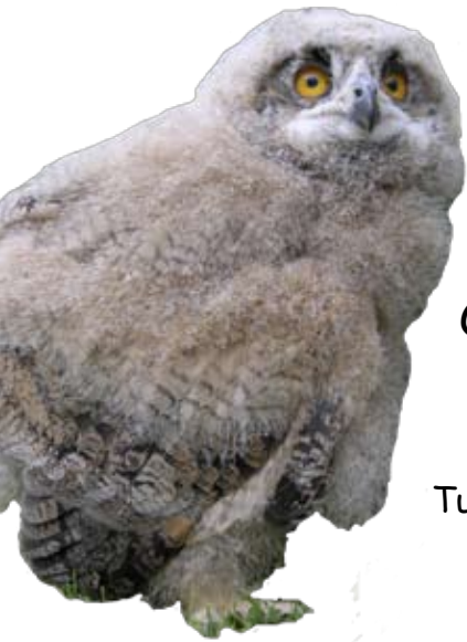
Left: 4 week old Turkmenian eagle owlet.

Pip and Rohan here are currently the only breeding pair in the UK.