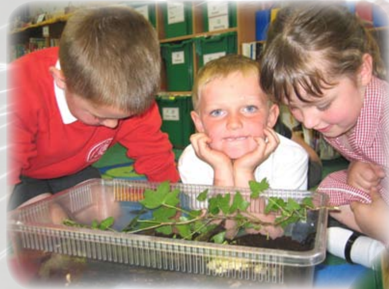
Stanley, Max and Emma take a look at the beetle tank.

We have a variety of smaller animals such as invertebrate species, reptiles, small mammals and birds which give us endless scope to teach a range of science, history, geography, art and maths related subjects at your school or playgroup.