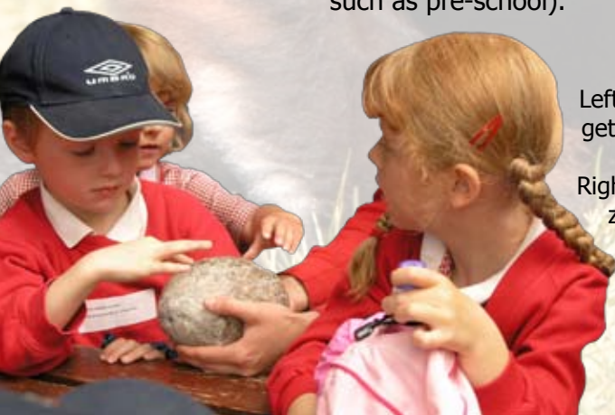
Left: Children of Earith School get to see a 65 million year old dinosaur egg.

(This is not generally recommended for very young children such as pre-school).