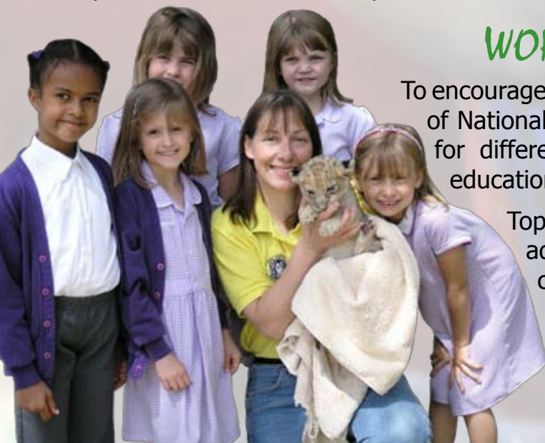
Left: Children of Barton Seagrave School got an extra special treat when they met Zara, the hand-reared African lion cub.

Topics include life processes, classification, adaption, feeding relationships, animal figures, countries and habitat and map reading skills.