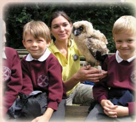
A Brown wood owllet meets children of Bramford School.

BIAZA constantly assesses the needs of zoo visitors, school children and teachers, as well as those of zoo educators. A survey showed that, in the UK, over 2 million pupils use the education services in BIAZA Zoos each year. This statistic does not account for school visits which do not use formal education facilities. Nothing can replace the experience of closeness with living animals; they are a zoo's greatest attraction and its strongest educational resource.