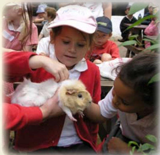
Meeting a more familiar animal, the guinea pigs are always a favourite.

BIAZA constantly assesses the needs of zoo visitors, school children and teachers, as well as those of zoo educators. A survey showed that, in the UK, over 2 million pupils use the education services in BIAZA Zoos each year. This statistic does not account for school visits which do not use formal education facilities. Nothing can replace the experience of closeness with living animals; they are a zoo's greatest attraction and its strongest educational resource.