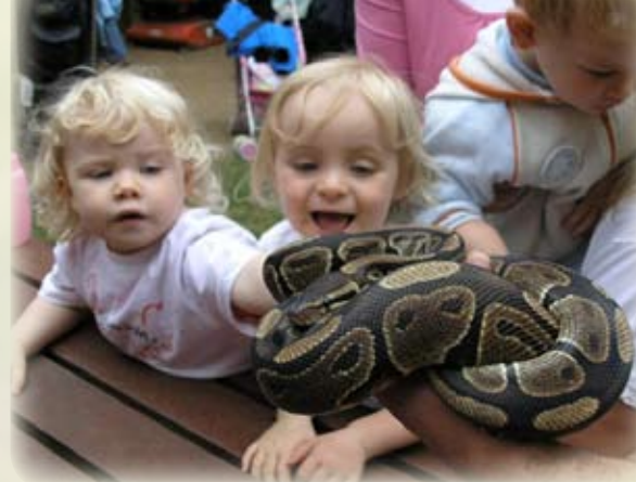
School children meet Percy, the Royal Python at our Fur, Feathers, Scales and Dinosaurs talk.

Many species of animal are rapidly disappearing in the wild, but their presence in zoos around the world provides a unique opportunity to inform and instruct people. The British and Irish Association for Zoos and Aquaria (BIAZA) demands a commitment to education from its members, most of which employ full or part-time education staff, though relatively few receive financial assistance from local authorities.